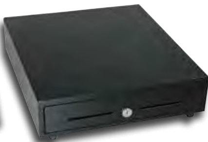
Connect up to eight cash drawers.