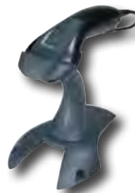
Add a scanner at each POS device.