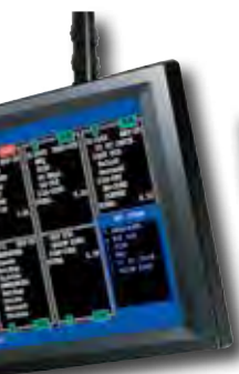
the E-Pad item.