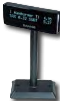
Connect up to two pole displays.