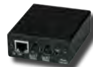
Datacap payment device.