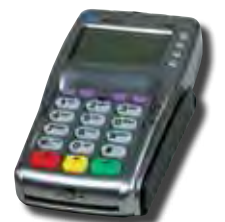
Verifone VX 805 PIN pad.