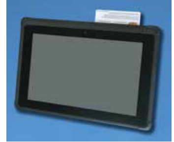
Integrated Card Reader Standard