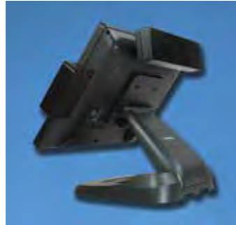
Optional Integrated VFD Customer Display