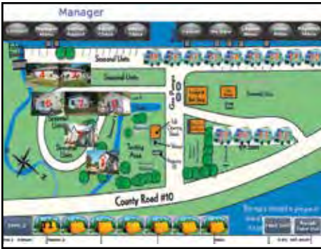
Customized graphical table maps.