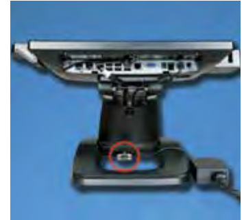
Cable Management Keeps Cords Hidden and Organized (RJ48-DB9M Adaptor Included)