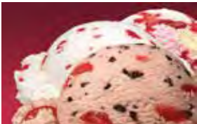
Bars / Ice Cream Parlors / Coffee Shops