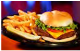
Cafeterias / Table Service / Quick Service