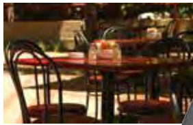
Food Concessions / Fast Casual Restaurants