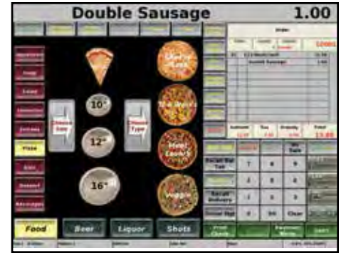
Graphic screens guide operators with minimal training.