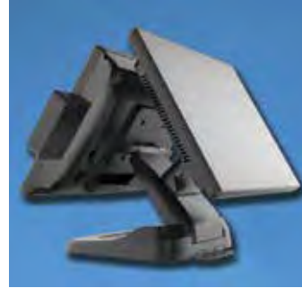
Optional Integrated 15" Rear LCD Customer Display (Reflection POS for Windows)