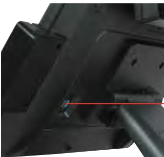
Two USB Ports Located on the Back of the Unit