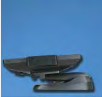
Double Articulating Terminal Folds Flat