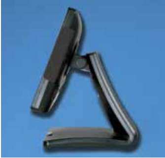
Sleek and Stylish Cabinet Design