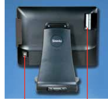
Two Additional USB Ports