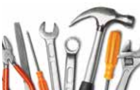
Hardware, Paint or General Retail Stores