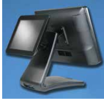
Optional Integrated 9.7" and 15" Rear LCD Customer Displays