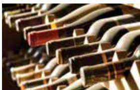
Tobacco / Wine / Small Grocery Stores