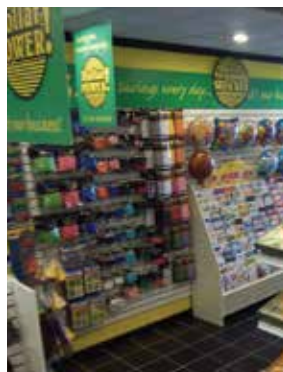
Convenience Stores / Dollar Stores / Gift Shops