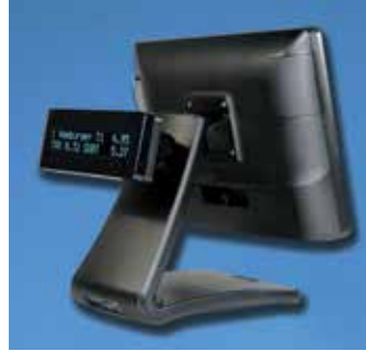
Optional Integrated Rear 2 Lines by 20 Characters VFD Customer Display