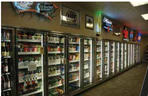
Beer / Liquor Stores