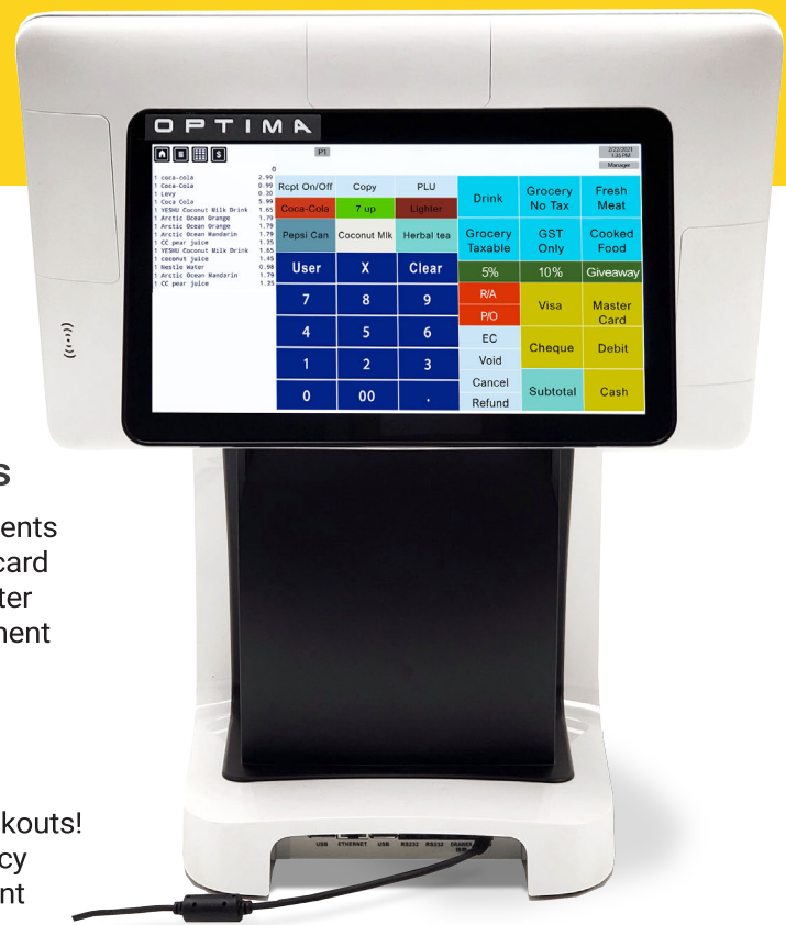
10.1" Customer Display *Standard feature