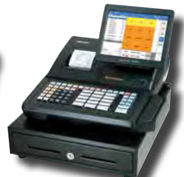
SAM4s SAP-530 RT Raised-Key Keyboard; 3" Receipt Printer