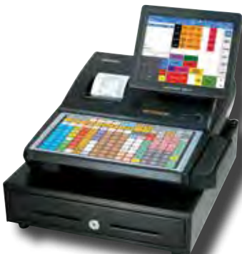
SAM4s SAP-530 FT Flat Spill-Resistant Keyboard; 3" Receipt Printer