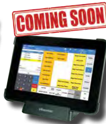
Hisense HM616 Android Tablet