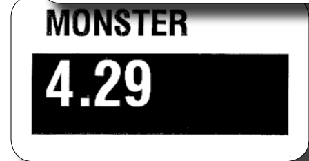
Labels printed on the SNBC BTP-L520 thermal desktop label printer shown actual size.