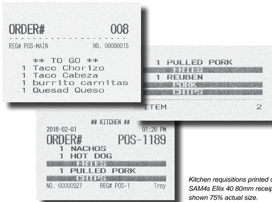
Kitchen requisitions printed on the SAM4s Ellix 40 80mm receipt printer shown 75% actual size.