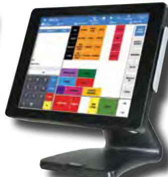
SAM4s SAP-6600 Touch Screen Terminal